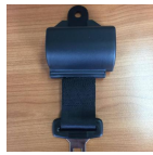
1067x100x35 Class II Tines