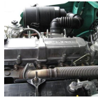
Reconditioned Toyota 2Z Engine

Out of Stock - Ring or email for Pricing AUD $ 1877 NO